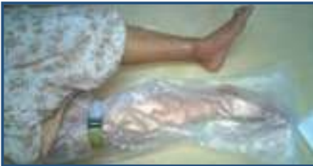
Ozone Bagging Application