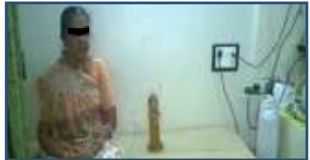
Breathing Ozone through oil (BOTO)