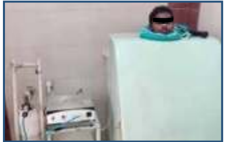
Ozone Steam Application