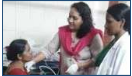
Glimpses of free Ozone Therapy camp organized at NIN