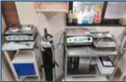
Ozone Department at NIN